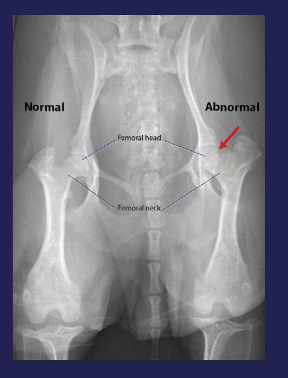
Figure 2 - A radiograph of the rear legs and hip joints of a dog with Legg-Calvé-Perthes disease. The head and neck of the femur are normal on one leg, but abnormal on the affected leg.