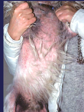
Figures 1 and 2 - Canine atopic dermatitis in Westies