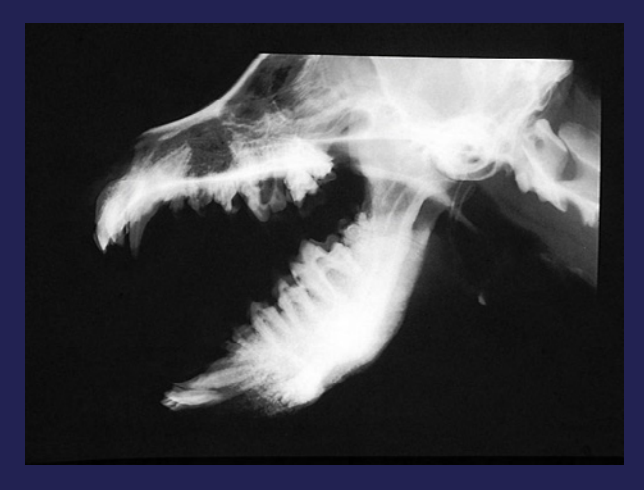
Figure 3 - Radiograph of anesthetized dog with CMO, with mouth open and view taken from the nose toward the back of the mouth. An endotracheal tube can be seen in the mouth (center, lower). Bilateral (both sides) disorderly bone growth on the mandibles and temporomandibular joints (white arrows) can be seen. The growth of this bone limits opening and closing of the mouth, ability to eat, is associated with pain and can be irreversible.

In rare cases, dogs may have radiographic evidence of bone proliferation on the mandible and skull, but not have trouble eating. Equally uncommon, some dogs may have disorderly proliferation of bone on other bones in the body, including the bones of the legs (Padgett et al, 1986).