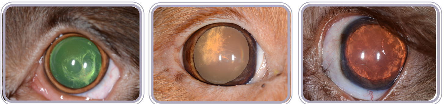
Figures 8.2 - Example of the different ways that cataracts can appear in dogs.

Although there is a risk of complications with any surgery, the short-term prognosis for the return of visual acuity after surgery exceeds 90%. The long-term outcome regarding restored or improved vision ultimately depends on the stage of the cataract at the time surgery is performed and other co-existing conditions. A protective collar will be applied to prevent the dog from scratching the eye and initially frequent eye drops or lubricants will need to be administered. Typically, dogs that undergo surgery are examined 1 week after surgery, at which time additional long term follow-up examinations will be scheduled, since there remains a risk for complications.