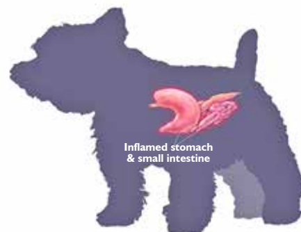
Figure 3 - This rare form of inflammatory bowel disease affects the small intestine and or stomach (enteritis and gastritis).