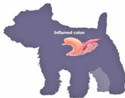
Figure 2 - This form of inflammatory bowel disease primarily affects the colon (colitis).