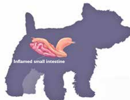
Figure 1 - The most common form of inflammatory bowel disease affects the small intestine (enteritis).