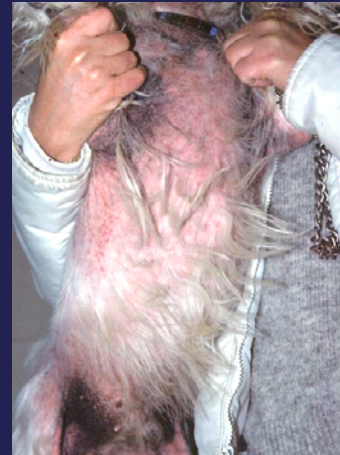
Figures 1 and 2 - Canine atopic dermatitis in Westies